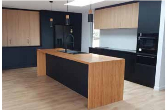
ECO - BAMBOO