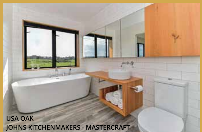
USA OAK JOHNS KITCHENMAKERS - MASTERCRAFT

All wood work dispatched from The WOODSMITHS is encased in expanded polystyrene specifically manufactured for the purpose to ensure maximum protection during freight and handling.