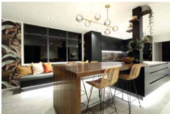
STAINED OAK - KITCHEN STUDIO NORTH SHORE

Make a statement in style and quality with Solid Wood Bench Tops by THE WOODSMITHS. Over a quarter of a century dedicated to enduring timber craftsmanship has made our badge synonymous with luxury and bespoke excellence. This commitment to quality and technical expertise is the reason we have been privileged to showcase the warmth of solid wood in some of the finest residential, hospitality and commercial interiors NZ wide.