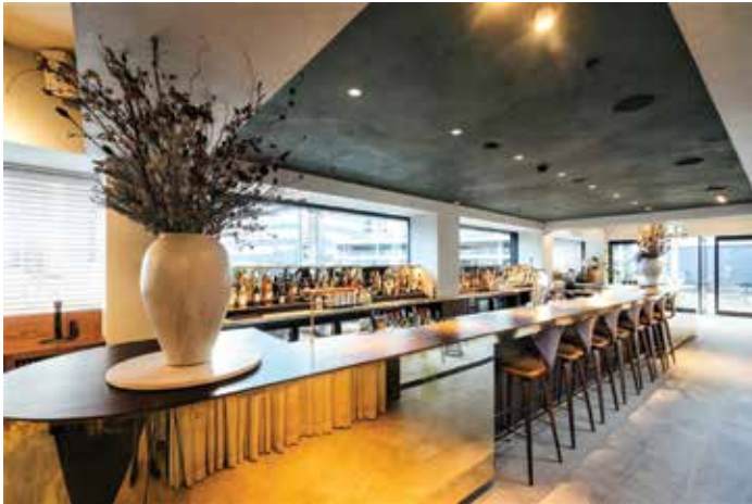
STAINED OAK BAR TOP - NORTHERN CLUB, DBJ