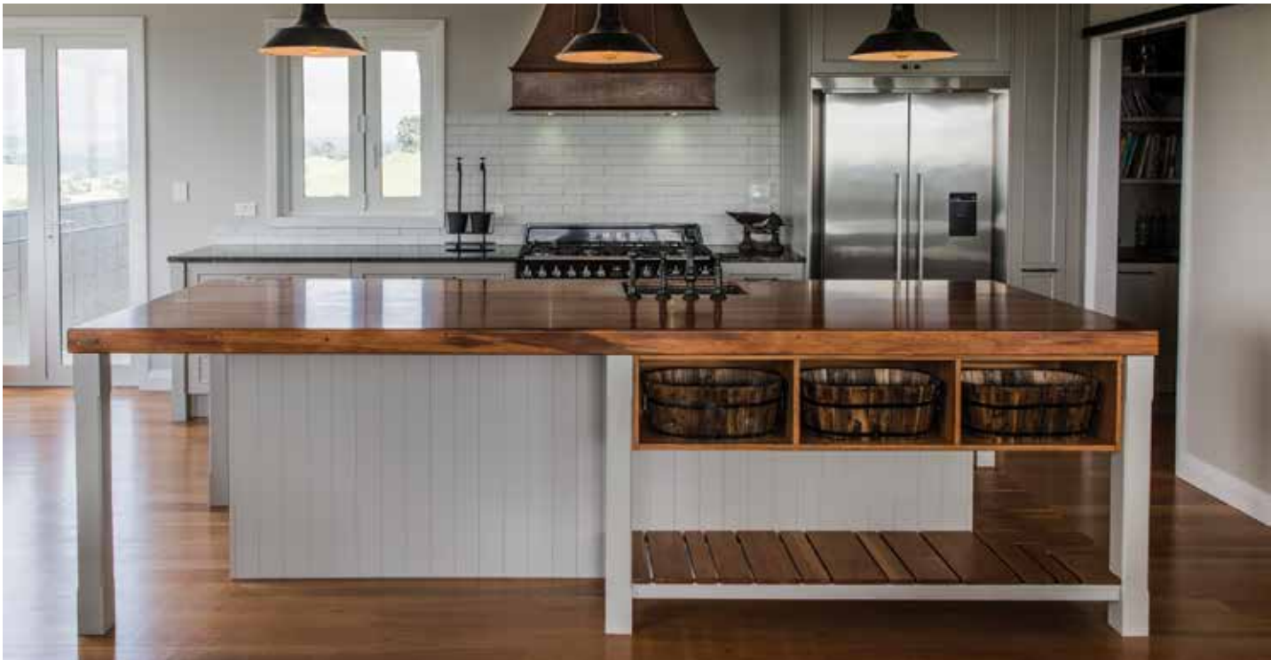
RECYCLED RIMU - KITCHEN & INTERIOR CO.

If you have any problems with your bench top, The Woodsmiths will be there to rectify it within 7 days.