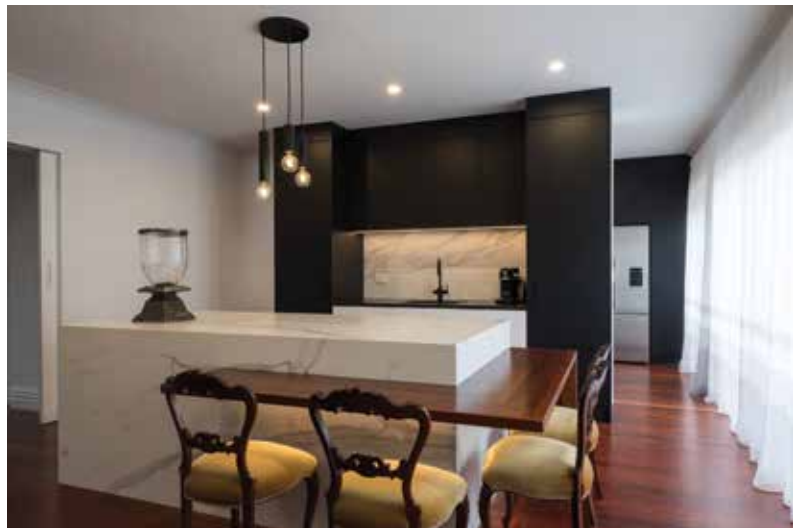
KWILA - ROYALE KITCHENS